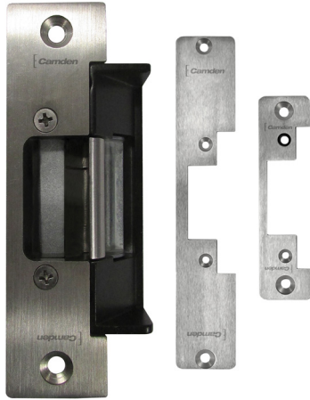
CX-ED2079 AND STAINLESS STEEL FACEPLATES